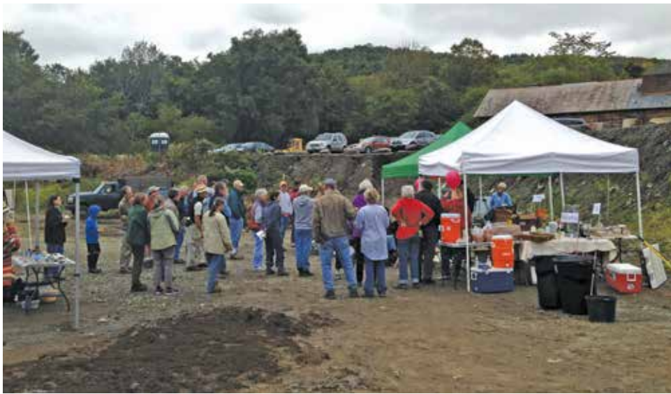
The East End Park site in 2013, when it was still nicknamed “The Jungle.”

lowed, and the soil had to be replenished for planting. “It started from a really rough point and volunteers came in and planted, built an amphitheater and a labyrinth, planted trees, built stone walls, and put up benches and picnic tables. Opening in 2020 was the culmination of years of putting in work. Now that it’s built, the joy has come from seeing how people use it.”