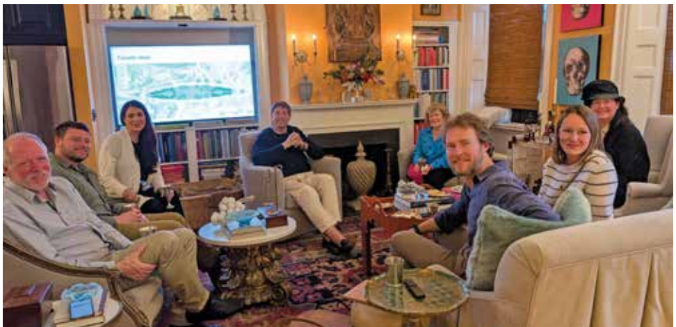
Woodstock Village Conservancy Fundraising Event.

ate safe, sustainable, and accessible streets and pathways for vehicles, bicycles, and pedestrians. Other initiatives include Branch Out Woodstock, which aims to plant trees in the downtown business district where trees have died, and developing a volunteer gardening corps to help maintain the spaces. To that end, the group wants to form Conservancy Corps,