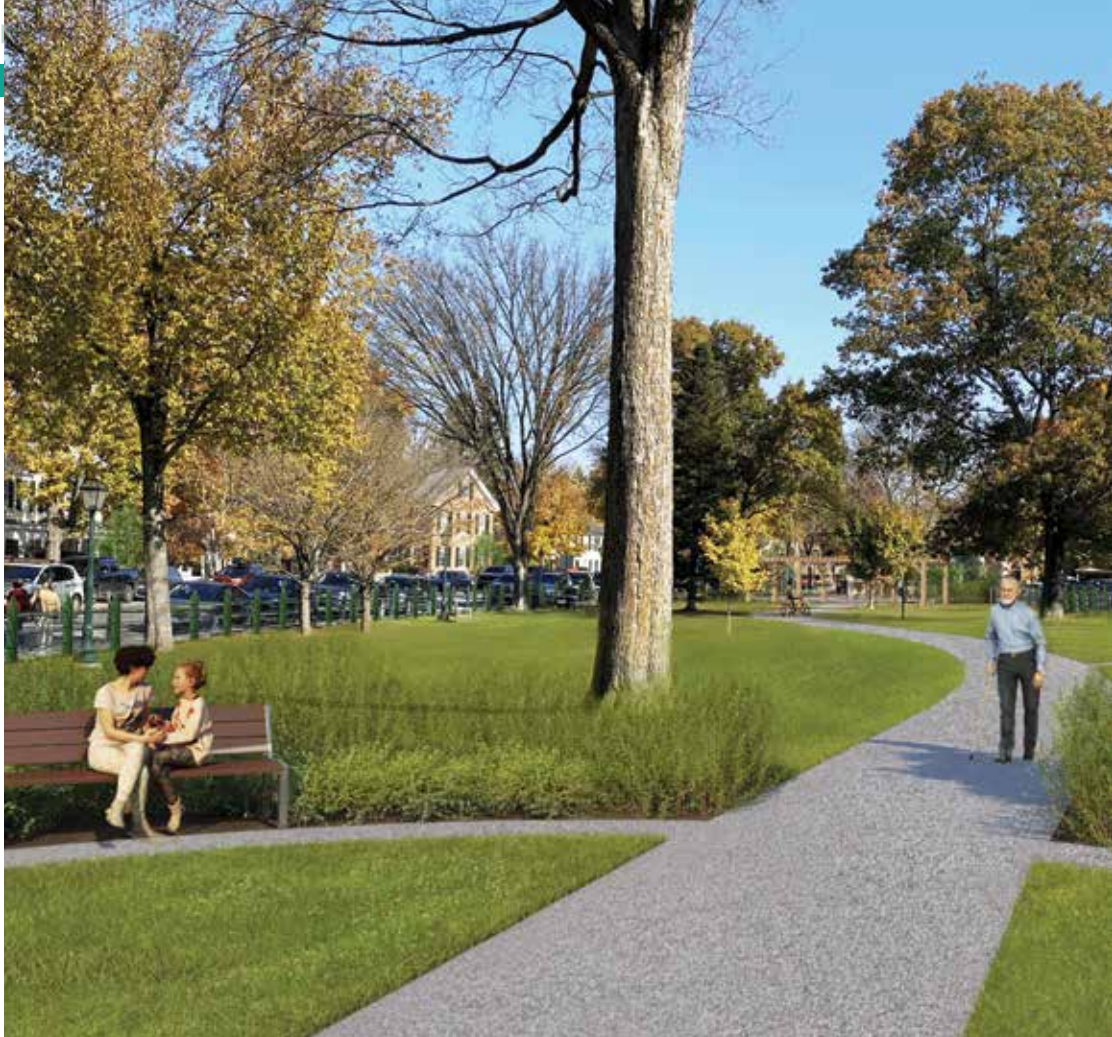
One conceptual rendering of a rehabilitated Green.