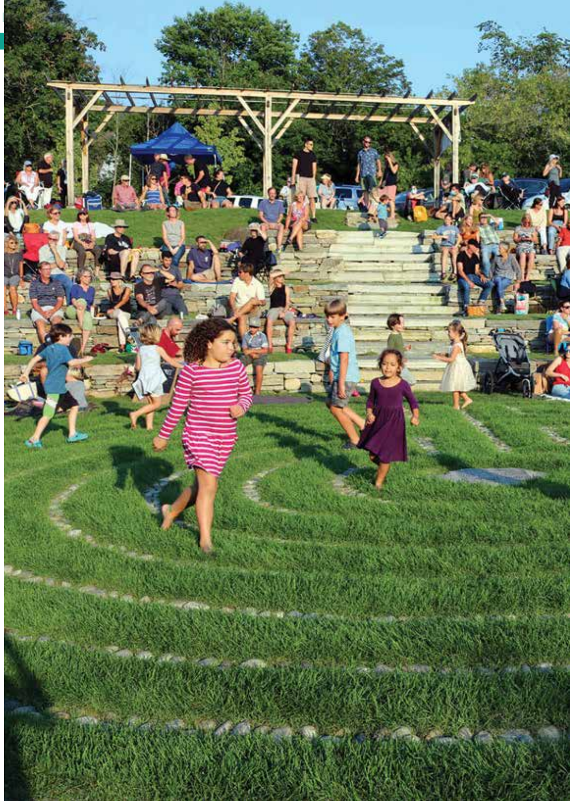
East End Park hosts many community events such as Music by the River.

There were a couple of plans over the years, Emily says, “but East End Action Group really kicked things off around 2012.” They organized under Sustainable Woodstock and applied for grants, built