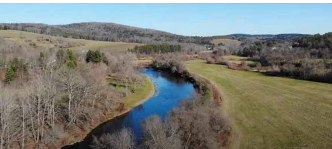
Ariel view of the river trail along the field and bird migration zone.

up with a major fundraiser, “and now the trail is totally rebuilt and better than before, with stone benches.”